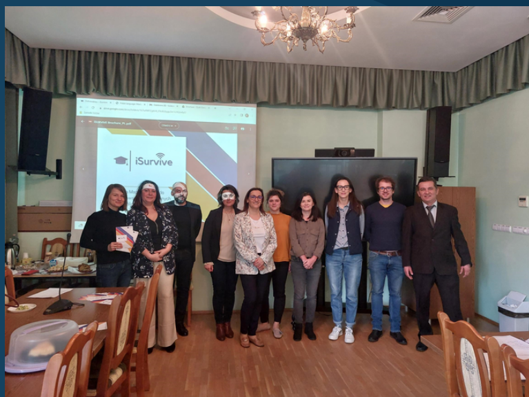
In Poland, Warsaw University of Life Sciences organized the Multiplier Event for March 31st. Here is a picture of the participants.

Multiplier events are a way for the whole society to benefit from the efforts and commitment made during the project. We believe that this type of activity is essential in this day and age to create a sense of sharing with all citizens and to spread knowledge.